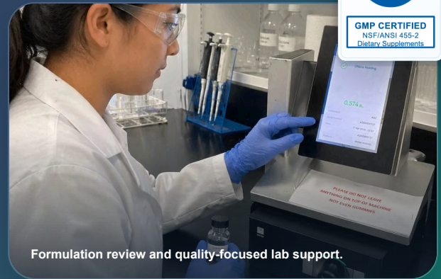
Formulation review and quality-focused lab support.

GIH supports brands from idea through formulation, quality review, production planning, packaging, and market-ready execution.